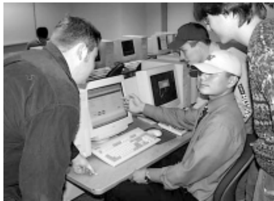
Students in a classroom search the UW Libraries Catalog

The Web-based Catalog was originally unveiled in April 1999. You can access it through the UW Libraries Information Gateway ( www.lib.washington.edu ) or directly at catalog.lib.washington.edu .