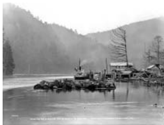
Spruce log raft at Kernville, near the mouth of the Siletz River [Oregon]

Theater, vaudeville and film are popular topics in the collection, as are many aspects of the timber industry. The particularly beautiful photograph below is part of the John Cress collection of logging photographs.