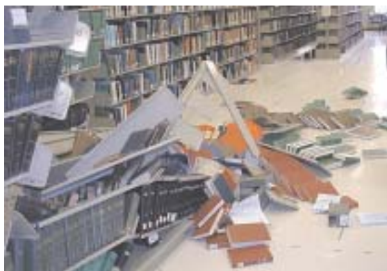
Fourth floor, Suzzallo Library stacks

big difference in how well the building fared during the earthquake. More detailed information about the Suzzallo Library Renovation Project is available at www.lib.washington.edu/about/suzzren/ .