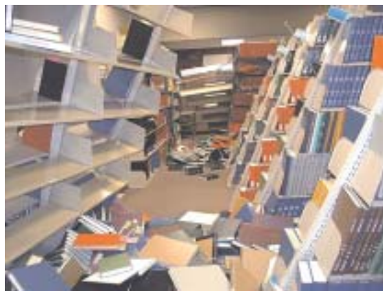
Earthquake damage in the Engineering Library

After a month of cleanup efforts, it's difficult to see the effects of the quake in most Libraries units. However, several libraries will require substantial replacement of shelving, especially the Engineering and Fisheries-Oceanography libraries. Following is a summary of the impact of the earthquake on the Libraries: