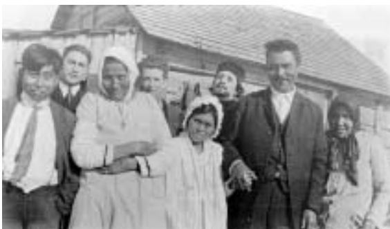
Native Wedding, Afognak, Alaska, ca. 1918

The photograph collections are wonderful glimpses of the history of our region. They may be the only record we have of a lost place. The Cooke collection, for example, contains photographs of the village of Afognak, Alaska, that was swept away in a 1964 tidal wave.