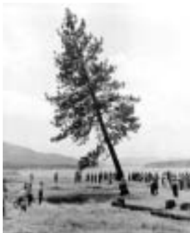
This photograph from an album on the Grand Coulee Dam documents when “the Last remaining tree in the Columbia River reservoir was cut down with fitting ceremony on July 19, 1941.”

There is widespread development of electronic resources and tools in science, medicine, technology, and business—coincidentally the areas that experience the greatest increases in serial publication costs. By focusing much of our efforts within these subjects we hope to increase our service while containing costs. In many respects cost containment will be the key test of our transformational efforts.