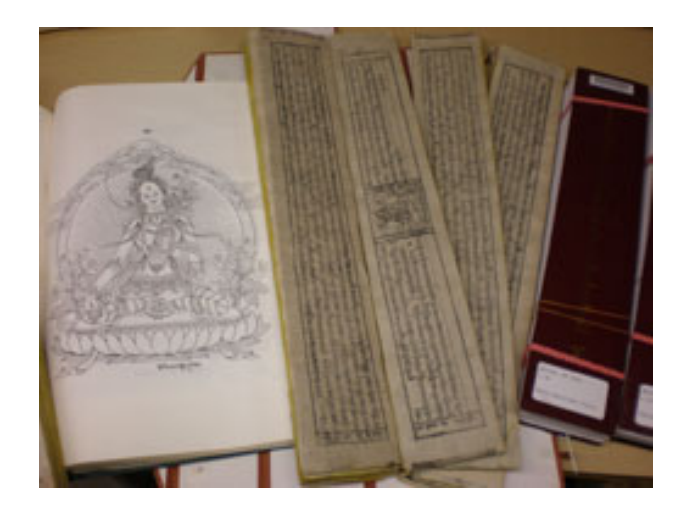
Tibetan books from the collection

The UW East Asia library has, as one of its treasures, over four thousand Tibetan language titles that were distributed to academic libraries as part of the ambitious and visionary PL- 480 currency exchange program, initiated in 1959 by president Dwight D. Eisenhower. By paying an annual five hundred dollar subscription fee, the University of Washington was one of a dozen Universities to receive tens of thousands of volumes in diverse South Asian Languages. While the program certainly aided India and other South Asian countries during a critical period, perhaps more significantly, it greatly enhanced the character and quality of scholarship at U.S. Universities, an effect that continues into the present day. The University of Washington Tibetan collection is one of the strongest such collections in the United States. Our collection will get greater attention and use in the coming years if we make all these valuable Tibetan resources available on the Libraries' online public catalog.