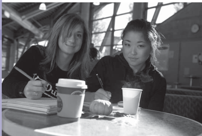
photo of UW Bothell students

The Friends mission is to increase awareness of the importance of the University Libraries to our community and region, help to stimulate private support and encourage an appreciation of the Libraries excellent staff, services and resources — from books and periodicals to digital collections.