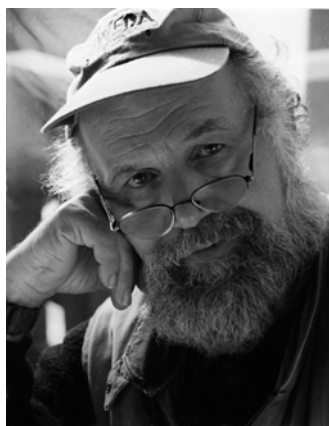
December 2000