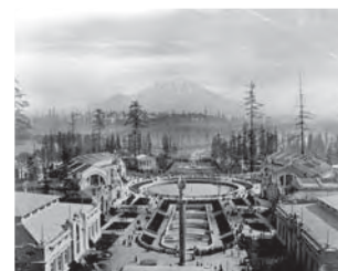
aerial view of AYPE

Contract with the Northeast Document Conservation Center to stabilize, clean, repair and fully restore copies of the Authorized Birds-eye View of the Alaska-Yukon-Pacific Exposition (AYPE).