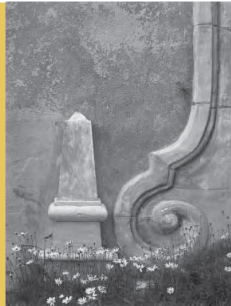
Carmel Mission Wall Detail, Carmel, California