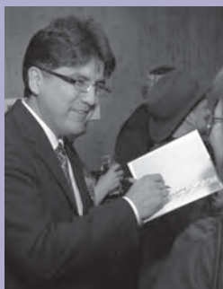
Sherman Alexie, Keynote Speaker, signs a book for a guest