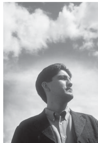
Sherman Alexie

Alexie, a Spokane/Coeur d'Alene Indian, grew up on the Spokane Indian Reservation in Wellpinit, Washington, about 50 miles northwest of Spokane.