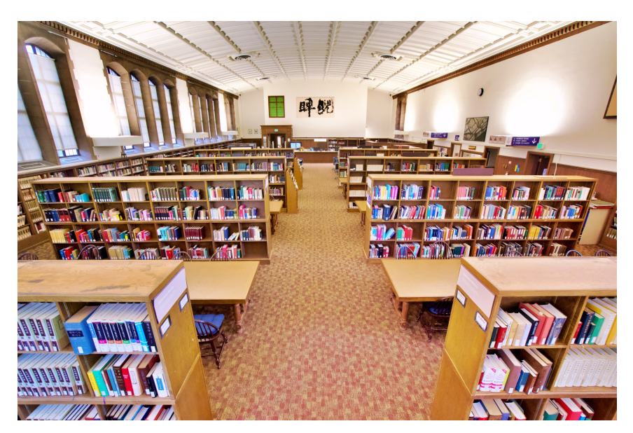
Tateuchi East Asia Library Beckmann Reading Room.