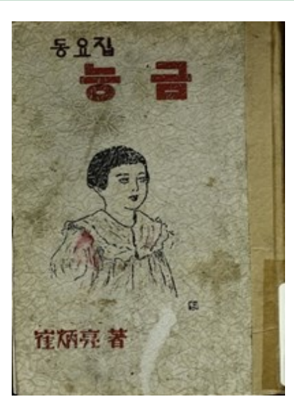
Ch'oe Pyŏng-yang 최병 양/崔炳亮, Nŭnggŭm: Tongyojip 능금: 동요집 [Apple: A Collection of Children's Songs], 1938

The goal of my research was to examine UW Libraries' pre-1945 Korean collection in terms of its authors, subject matter, time period, history, publication, book arts, and bibliographic classifications. TEAL recently completed the retrospective cataloging of earlier Korean materials from our collection, in the process uncovering over 200 rare titles, many of which were unique among libraries represented in the OCLC WorldCat international union catalog. Targeting these special materials for close study, I set out to compile a selected annotated bibliography with rich description of individual books and their noteworthy characteristics.