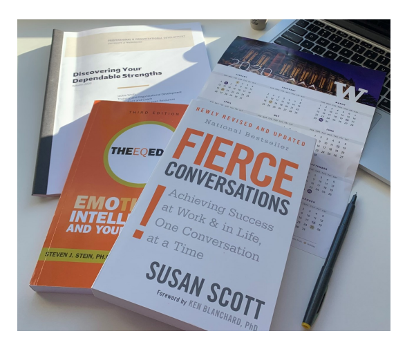
Some GOLD program assigned readings

Thanks to the support of the library director and my supervisor, I have had the opportunity to participate in the 2020-2021 GOLD program for library employee development. "GOLD" stands for Growth, Opportunity, Learning, and Development. The program consists of seven full-day and one half-day sessions from September 2020 to April 2021. Due to COVID-19, this year all coursework is online. Twelve library staff from different departments and campuses are participating in this year's program.