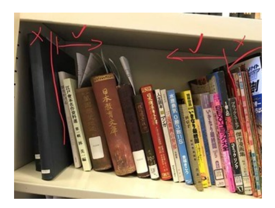
Book shelf photo with graphic annotations for use in preliminary cataloging

displayed on book spines, such as title, author or editor's name, publisher, and so on. Ross is detail-oriented, proficient at reading Chinese characters, and fluent in Japanese. He closely examined each photograph, logged questions and notes in a spreadsheet, and saved over 300 potentially matching records. Around 40 of these were full-level records, suitable models for copy cataloging. For the remaining books, we will need to verify and enhance incomplete records or create new ones after we examine the physical items at the library.