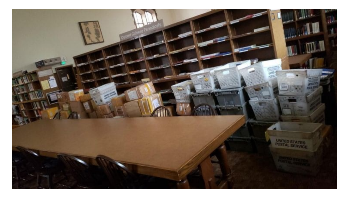
Months of overflow mail and book deliveries piled up in the TEAL reading room

For continued updates on the services that UW Libraries is able to provide, check the Coronavirus update page at <u>https://www.lib.washington.edu/</u> <u>coronavirus</u>