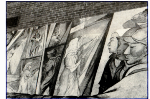
Local 541 Shipscale's Fresco, 1945

☞ STRUGGLE AGAINST RACIAL DISCRIMINATION AND FOR UNITY OF INTERNATIONAL LABOR, a 60 foot by 7 foot fresco on concrete by Mexican muralist PABLO O' HIGGINS, hangs in Kane Hall on the