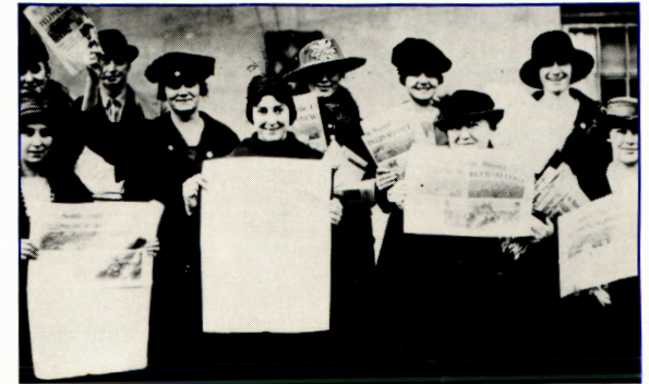
Telephone Workers on Strike, 1917