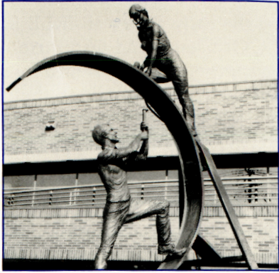
Rosie the Riveter, IAM 751 Hall